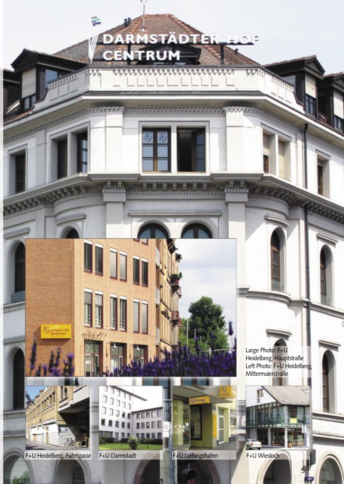
Large Photo: F+U Heidelberg, Hauptstraße Left Photo: F+U Heidelberg, Mittermaierstraße

Opening of the South Hesse International University of Cooperative Education, of the new premises in Hamburg and Cologne, and start of operations of the International Distance Learning University in Chemnitz. Founding of the F+U Lithuania in Vilnius and of the F+U Croatia in Zagreb. Acquisition of the Benedict School in Zwickau.