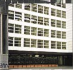
F+U Berlin Atrium