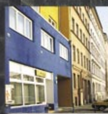
F+U Hotel Berlin