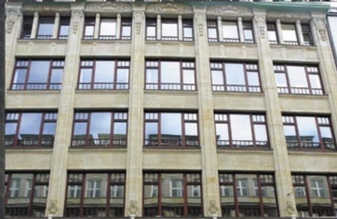
Large photo: F+U Berlin, Friedrichstraße Left photo: F+U Hamburg